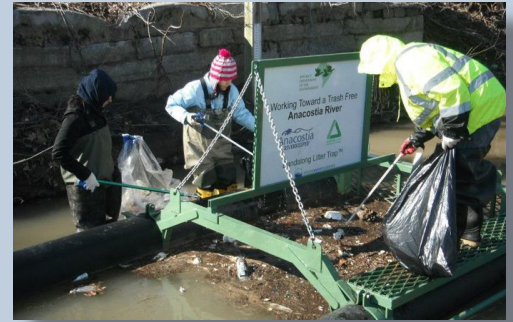
Green Team Members remove trash and debris from the Bandalong Litter Trap in Marvin Gaye Park in Washington DC